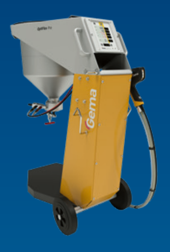
OptiFlex® Pro S