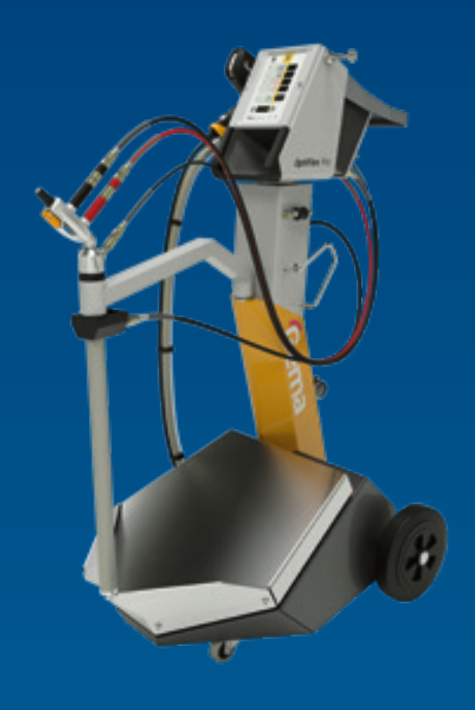
OptiFlex® Pro Q